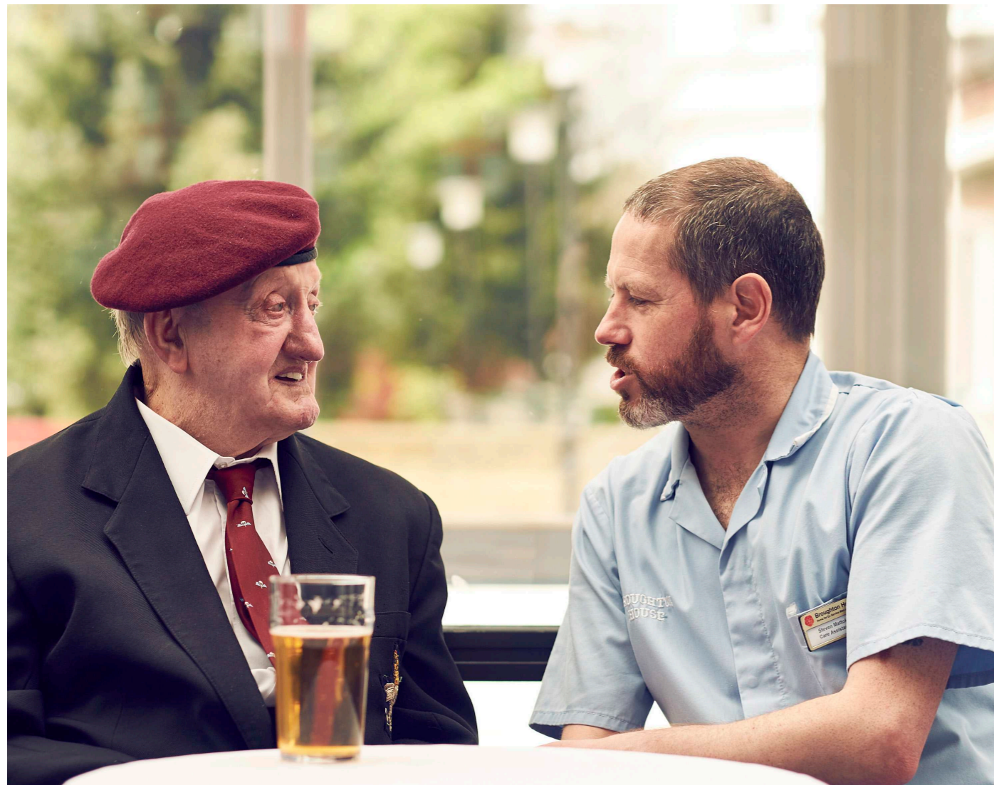
Photos and video footage from activities and events are regularly shared across our social media pages and website.

Our full and varied calendar of events ensures positive interactions amongst Residents, Volunteers, Employees and visitors. Residents have the opportunity to enjoy a wide variety of internal and external activities each month. For families, Broughton House provides that reassurance. Reassurance that their loved one is being cared for in a warm and friendly environment, with support and assistance on hand whenever required.